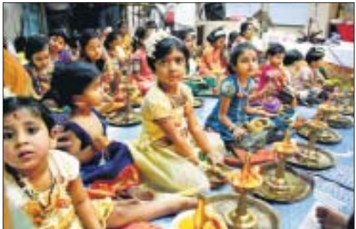
Young girls sitting for Kumari puja at Ayyappa temple in Rasta Peth on Saturday