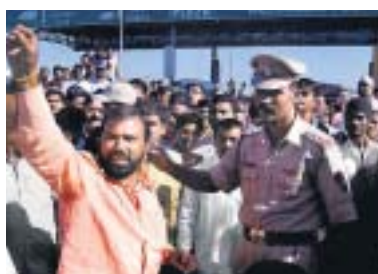
Villagers of Prene protesting on Saturday