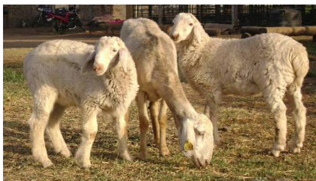
NARI Composite ewe with twin lambs in the NARI nucleus flock

The breeding decisions were taken so as to balance the progress towards the achievement of three important goals: producing more FecB carrier animals for dissemination and for improving the selection intensity in the NARI nucleus flock, improving the physical appearance and conformation of FecB carrier animals through the introduction of Deccani