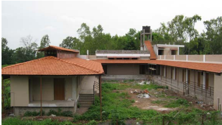
CSD building nearing completion