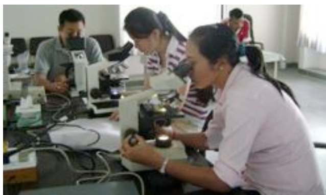
Trainee officers from Sikkim Animal Husbandry Department learning how to measure faecal worm egg counts of sheep during the training programme at NARI AHD