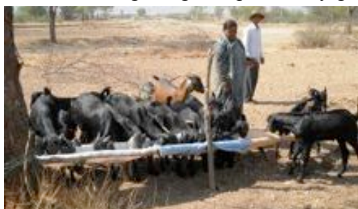
Example of pro-poor goat-based technology: a cheap feeder for feeding concentrate to goats, constructed by NARI personnel for Sonba Godse's flock in Bibi