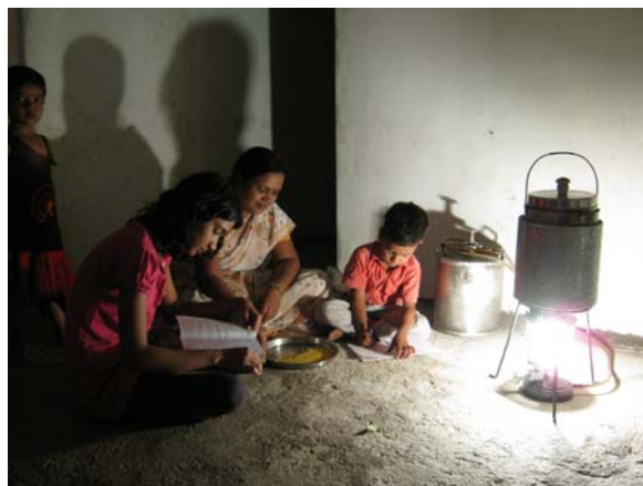
Figure 1. Lanstove testing in actual user dwelling