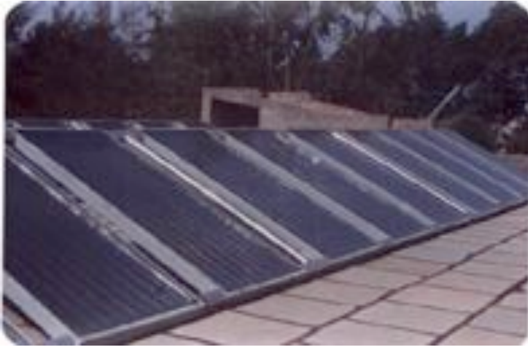
Fig 2. Solar powered Ethanol distillation plant

An improved, multifuel lantern called "Noorie" was developed. It is a pressurised mantle lantern producing light output of 1250-1300 lumens (equivalent to that from a 100 W light bulb). Compared to existing pressurised kerosene lanterns, this lantern consumes only 60% of the kerosene and operates at one-third the pressure. It can run on kerosene, ethanol or diesel. Ethanol concentrations of a minimum of 80% (v/v) are required [5]. A pressurised alcohol stove has also been developed. It requires a minimum ethanol concentration of 50% (w/w) and above to run. Its heating capacity is 2.5 kW (thermal) for 50% (w/w) ethanol concentration and its thermal efficiency is between 40-55%. Fig 3. Shows the stove.