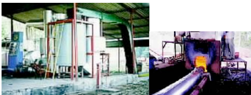
Fig 4. Biomass Gasifier and furnace

The gasifier is an open top, throatless (cylindrical) type and requires the biomass residues to be chopped into 1-10 cm long particles, which is carried out using a 2.3 kW electric chaff cutter. The gas produced (mainly comprising of 15-25% carbon monoxide, 10-20% hydrogen and 1-5% methane), is combusted in a special burner designed at NARI. It is basically a venturi-type burner with a plate for flame stabilization. It produces a bluish-white flame with temperatures exceeding 1250°C. Figure 3 shows the gasifier with the flame.