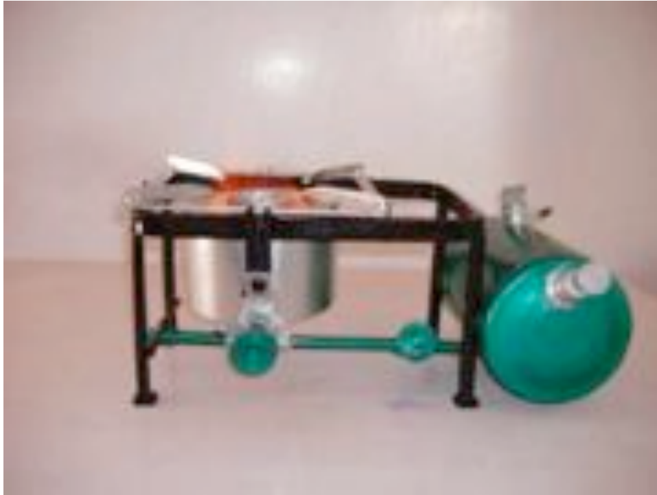
Fig 3. Low concentration Ethanol Stove