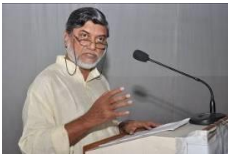
AKR delivering the lecture