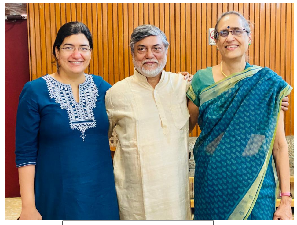
At IIC; Good looking happy family!