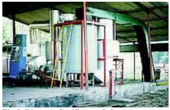
Fig 3. Biomass Gasifier and furnace

The gasifier is an open top, throatless (cylindrical) type and requires the biomass residues to be chopped into 1-10 cm long particles, which is carried out using a 2.3 kW electric chaff cutter. The gas produced (mainly comprising of 15-25% carbon monoxide, 10-20% hydrogen and 1-5% methane), is combusted in a special burner designed at NARI. It is basically a venturi-type burner with a plate for flame stabilization. It produces a bluish-white flame with temperatures exceeding 1250<sup>o</sup>C. Figure 3 shows the gasifier with the flame.