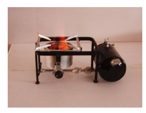
Fig 3. Low concentration Ethanol Stove