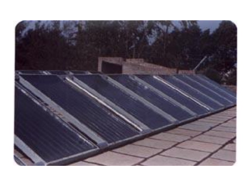
Fig 2. Solar powered Ethanol distillation plant

An improved, <u>multifuel lantern called "Noorie"</u> was developed. It is a pressurised mantle lantern producing light output of 1250-1300 lumens (equivalent to that from a 100 W light bulb). Compared to existing pressurised kerosene lanterns, this lantern consumes only 60% of the kerosene and operates at one-third the pressure. It can run on kerosene, ethanol or diesel. Ethanol concentrations of a minimum of 80% (v/v) are required [5]. A pressurised <u>alcohol stove</u> has also been developed. It requires a minimum ethanol concentration of 50% (w/w) and above to run. Its heating capacity is 2.5 kW (thermal) for 50% (w/w) ethanol concentration and its thermal efficiency is between 40-55%. Fig 3. Shows the stove.